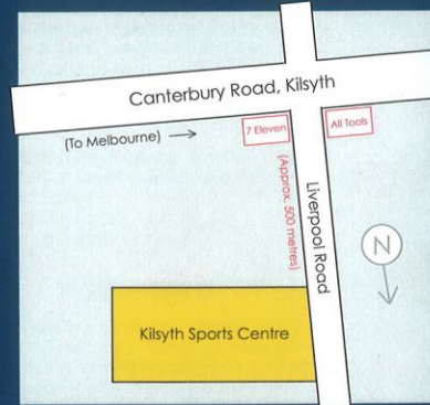
(MELWAY REF: P.51 - H7)

The Kilsyth Sports Centre is located in the Eastern Suburbs of Melbourne on Liverpool Road just off Canterbury Road, in Kilsyth, Victoria.