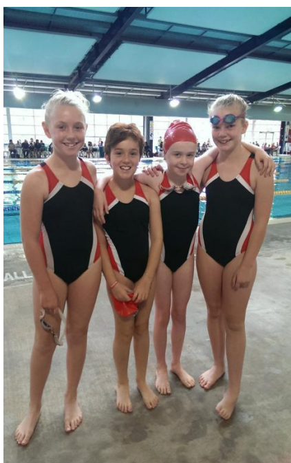
Girls 11YO Freestyle Relay Team